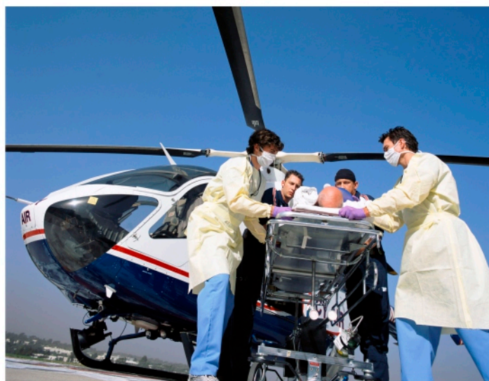
Sirio S2/T MRI compatible can be used in helicopter.