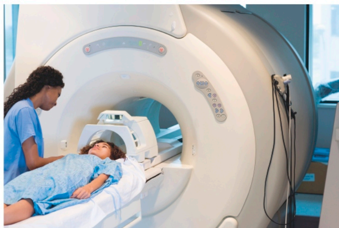
Sirio S2/T MRI compatible can be used in Magnetic Resonance from 1,5 to 3,0 Tesla.