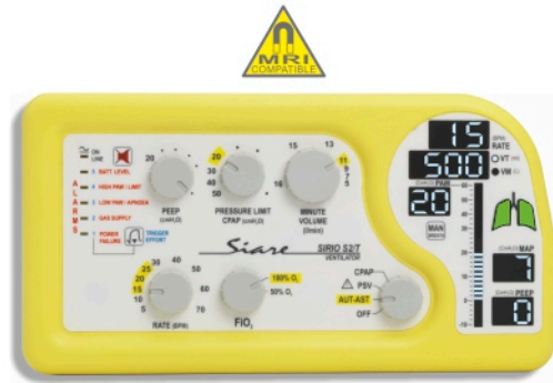
Code 09636/RMN - SIRIO S2/T for MRI